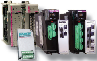
Allen-Bradley® Compatible Plug-in Weigh Scale Modules

Controllers, Weigh Modules, Transmitters