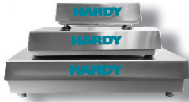
Hardy Bench Scales