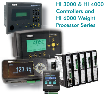
HI 3000 & HI 4000 Controllers and HI 6000 Weight Processor Series