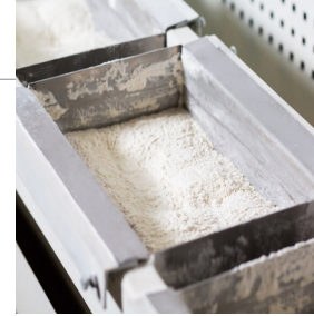
Class II Combustible Dust