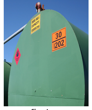
Class I Flammable Gases or Vapors

Where combustible dust is present in the air under normal operating conditions in such a quantity as to produce explosive or ignitable mixtures. This could be on a continuous, intermittent or periodic basis.