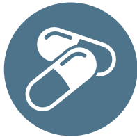
Pharmaceutical & Biotech