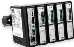
Hardy HI 6600 Modular Sensor System