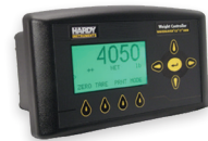
Hardy HI 4050 Weight Controller and HI 6500 & HI 6200 Weight Processors