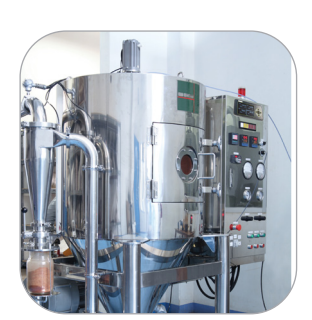
Loss in Weight/Gain in Weight Batch Control

Our weighing solutions support weighing in processing and packaging equipment across all stages of manufacturing. Some examples are: