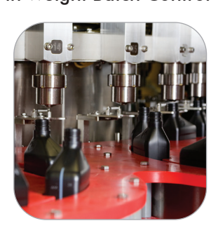
Filling & Dispensing