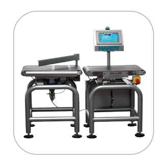
Single Lane or Multilane Check Weighing