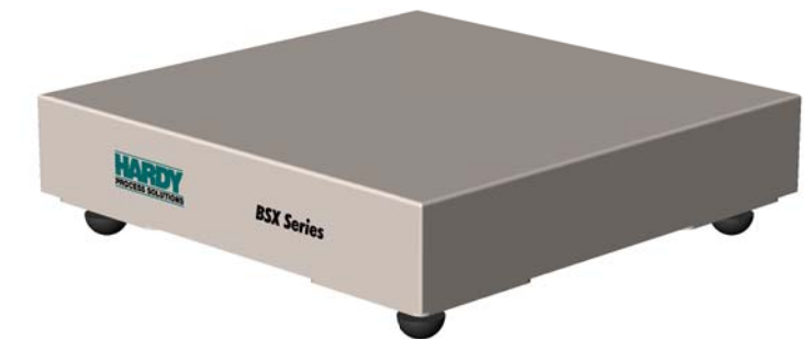
HI BSX SS6 BENCH SCALE SERIES

PROPRIETARY NOTICE ALL DATA AND INFORMATION CONTAINED IN OR DISCLOSED BY THIS DOCUMENT IS CONFIDENTIAL AND PROPRIETARY INFORMATION OF HARDY PROCESS SOLUTIONS AND ALL RIGHTS THEREIN ARE EXPRESSLY RESERVED. BY ACCEPTING THIS MATERIAL THE RECIPIENT AGREES THAT THIS MATERIAL AND THE INFORMATION CONTAINED THEREIN IS HELD IN CONFIDENCE AND IN TRUST AND SHALL NOT BE USED, COPIED, REPRODUCED IN WHOLE OR IN PART, NOR ITS CONTENTS REVEALED IN ANY MANNER TO OTHERS, EXCEPT TO MEET THE SPECIFIC PURPOSE FOR WHICH IT WAS DELIVERED.