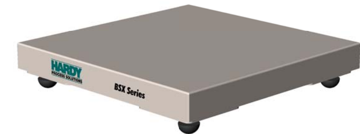
HI BSX AL22 BENCH SCALE SERIES

PROPRIETARY NOTICE ALL DATA AND INFORMATION CONTAINED IN OR DISCLOSED BY THIS DOCUMENT IS CONFIDENTIAL AND PROPRIETARY INFORMATION OF HARDY PROCESS SOLUTIONS AND ALL RIGHTS THEREIN ARE EXPRESSLY RESERVED. BY ACCEPTING THIS MATERIAL THE RECIPIENT AGREES THAT THIS MATERIAL AND THE INFORMATION CONTAINED THEREIN IS HELD IN CONFIDENCE AND IN TRUST AND SHALL NOT BE USED, COPIED, REPRODUCED IN WHOLE OR IN PART, NOR ITS CONTENTS REVEALED IN ANY MANNER TO OTHERS, EXCEPT TO MEET THE SPECIFIC PURPOSE FOR WHICH IT WAS DELIVERED.