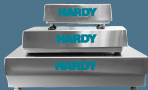
Hardy Bench and Floor Scales