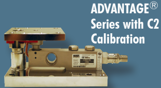
ADVANTAGE® Series with C2 Calibration

Hardy carries a wide variety of strain gauge load points and scale mounts to accommodate your application requirements.