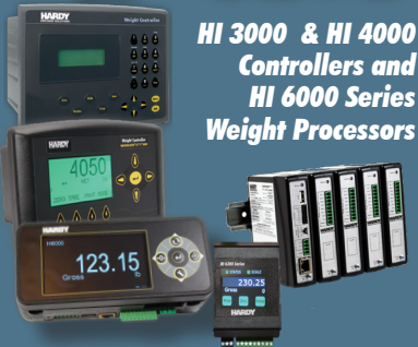
HI 3000 & HI 4000 Controllers and HI 6000 Series Weight Processors